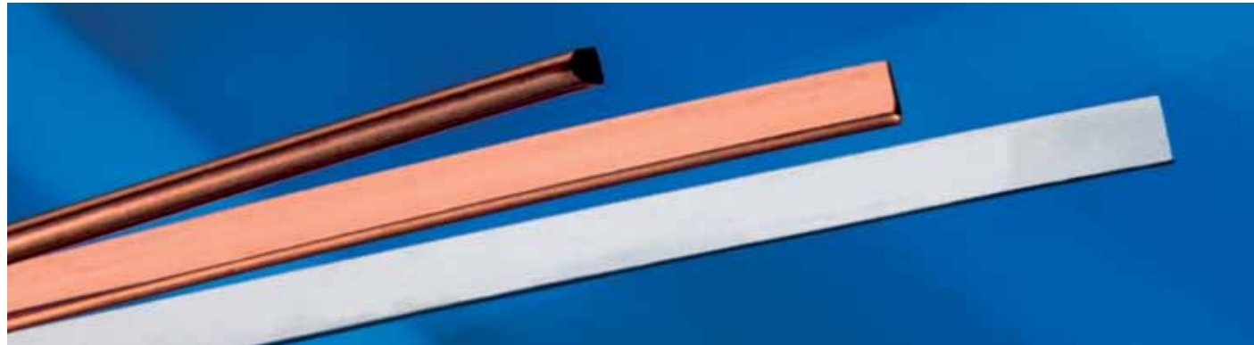
Sunwire is rolled from round wire and hot-dip tinned. This unique technology brings strength from softness.