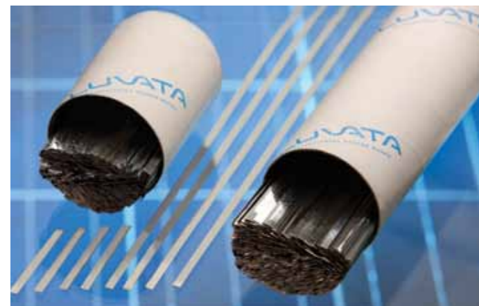
Sunwire is also available in pre-cut form. All our packaging materials have been designed to protect the product during transportation and storage, and are fully recyclable.

Sunwire's soft copper has a yield strength well below 60 N/mm 2 in normal production, which means there is less tension on the solar cells during soldering – so cell breakage is much less likely. This also means that a larger base copper cross-section is possible, improving the overall output of each module.